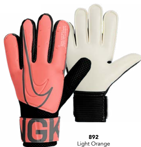
892 Light Orange