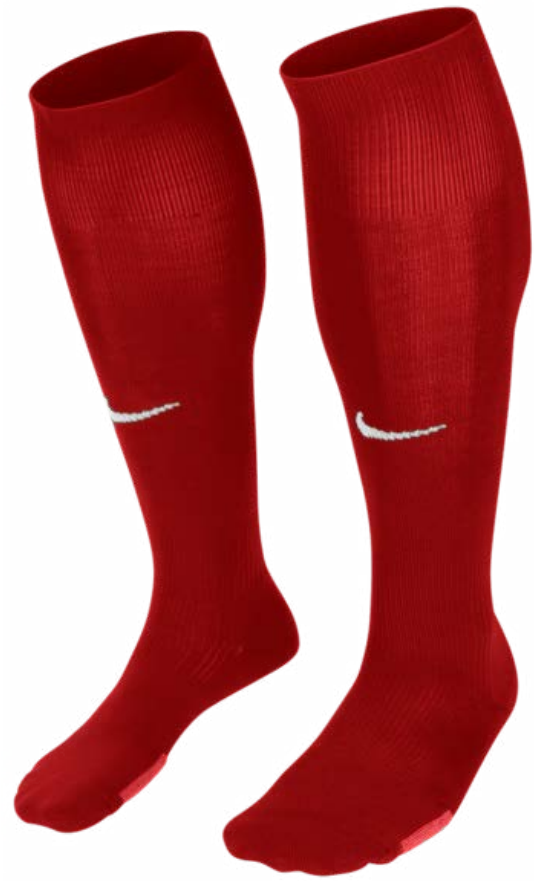
657 Uni Red