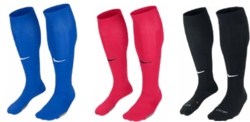
463 Royal Blue