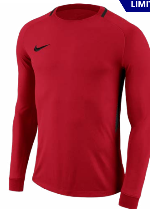
634 Habanero Red