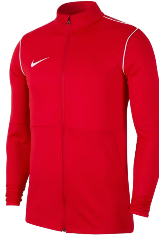
657 Uni Red