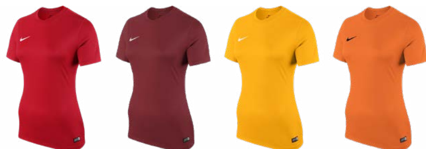
657 - Uni Red 677 - Team Red 739 - Uni Gold 891 - Orange