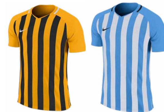
739 Uni Gold/Black 412 Uni Blue/White