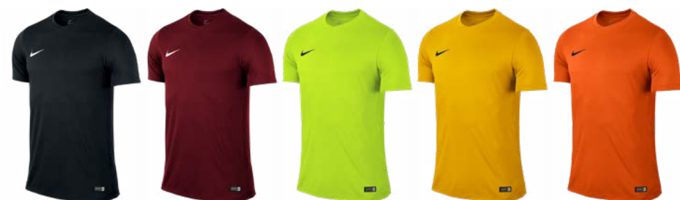
010 - Black 677 - Team Red 702 - Volt 739 - Uni Gold 815 - Orange