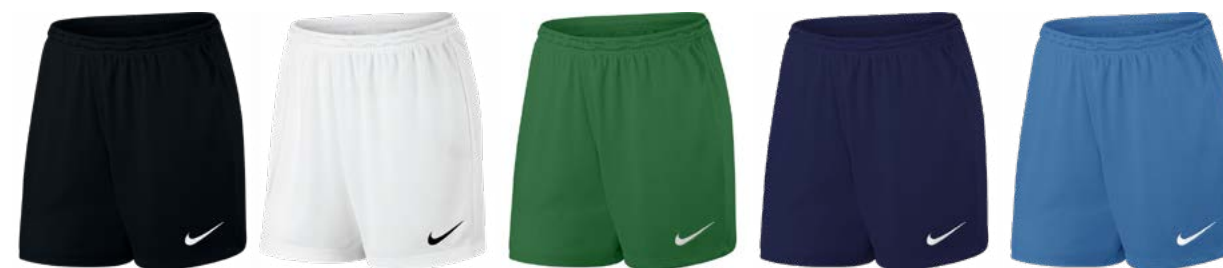
010 - Black 100 - White 302 - Pine Green 410 - Navy 412 - Uni Blue