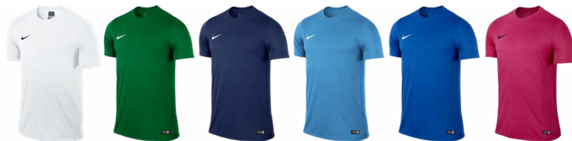
100 - White 302 - Green 410 - Navy 412 - Uni Blue 463 - Royal 616 - Vivid Pink