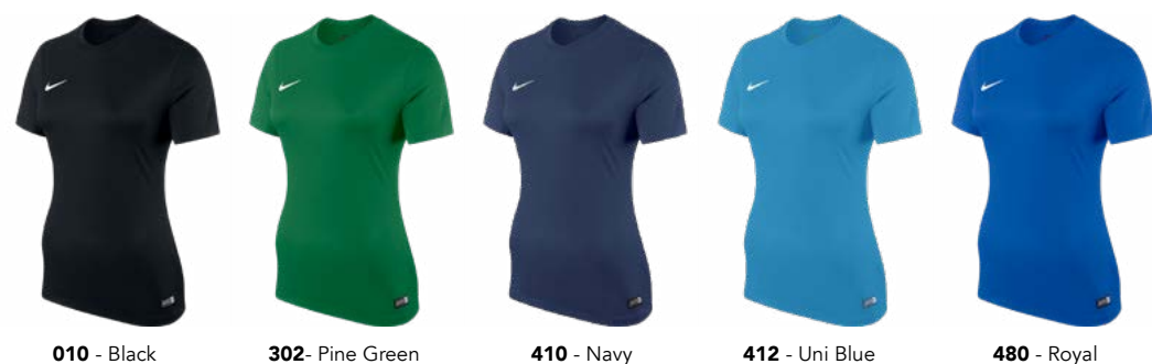
010 - Black 302 - Pine Green 410 - Navy 412 - Uni Blue 480 - Royal