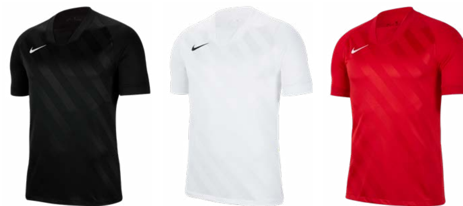
010 Black (ADULTS ONLY) 100 White 658 Uni Red