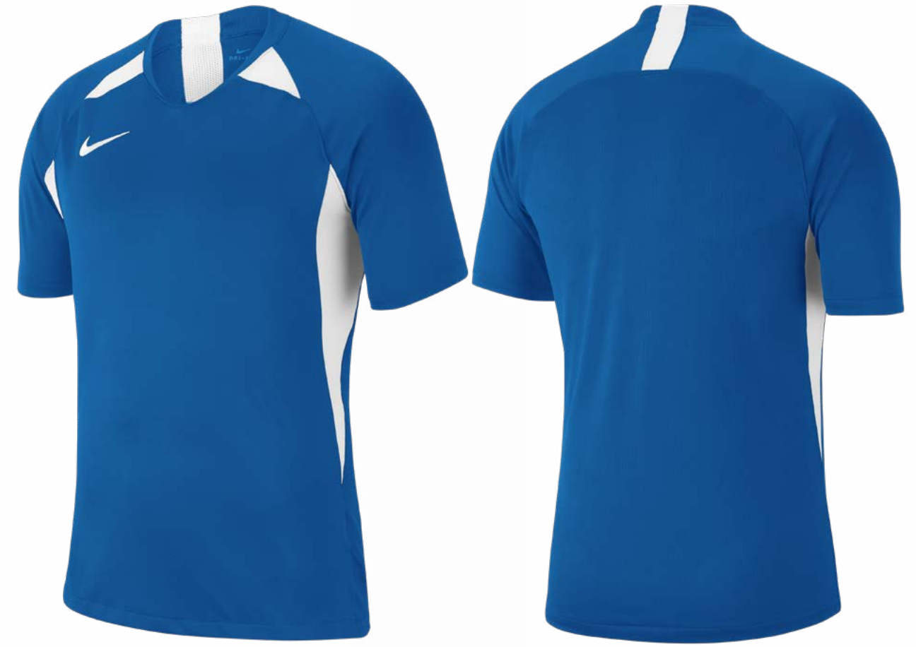
463 Royal Blue