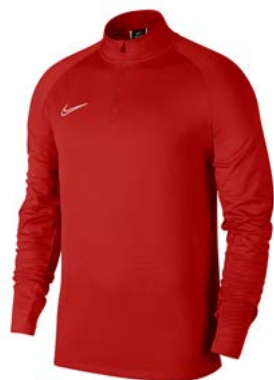
657 Uni Red