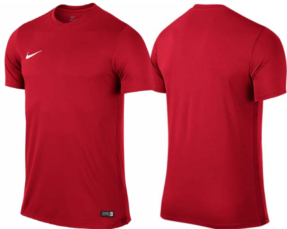
657 Uni Red