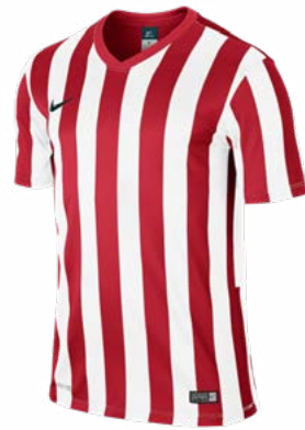
658 White/Uni Red