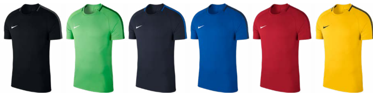
010 Black/Anthracite 361 Spark Green/Pine Green 451 Navy/Royal Blue 463 Royal Blue/Navy 657 Uni Red/Gym Red 719 Tour Yellow/Anthracite