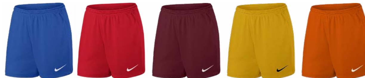
480 - Royal 657 - Uni Red 677 - Team Red 739 - Uni Gold 891 - Orange