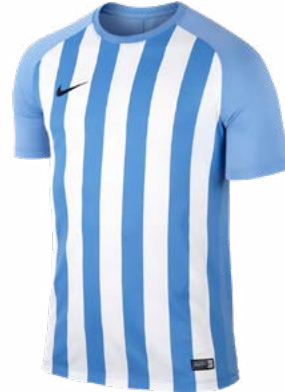
412 Uni Blue/White