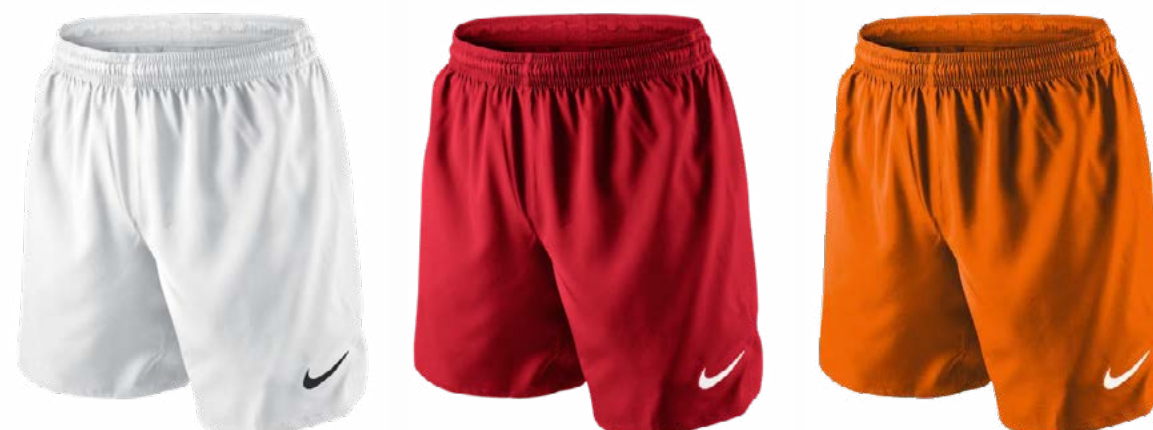
100 White 617 Uni Red 815 Safety Orange