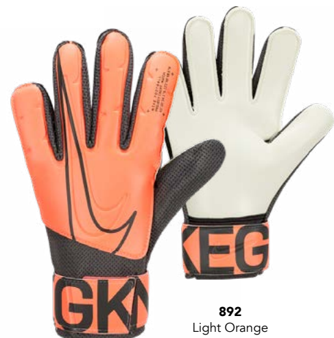
892 Light Orange