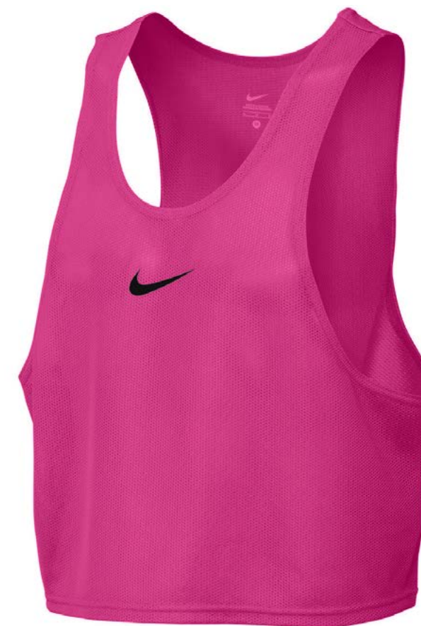
616 Vivid Pink