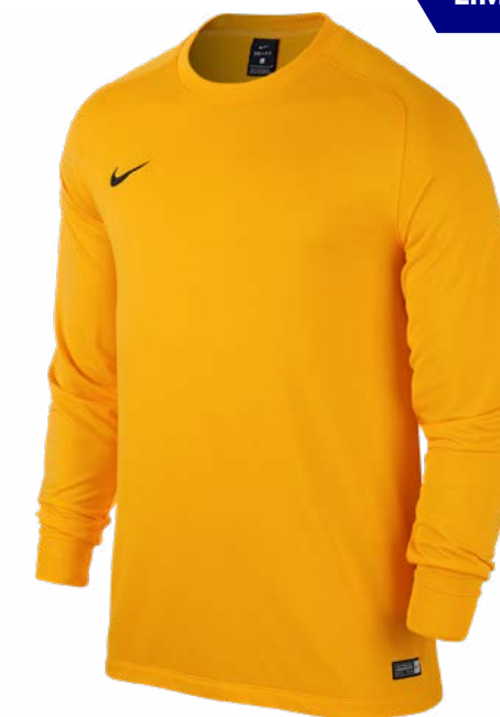
739 Uni Gold