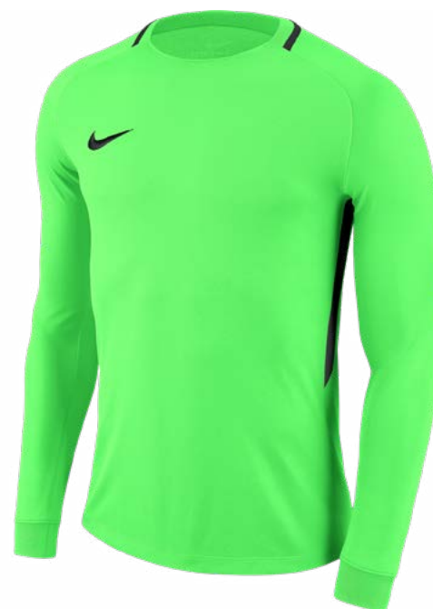
398 Green Strike