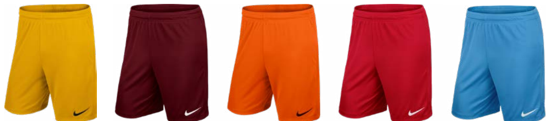
739 - Uni Gold