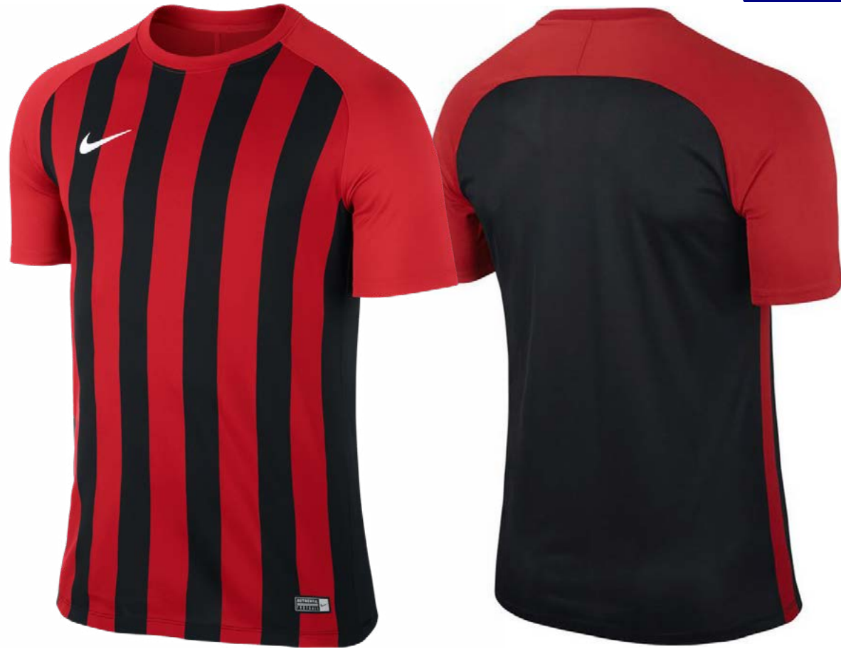
657 Black/Uni Red