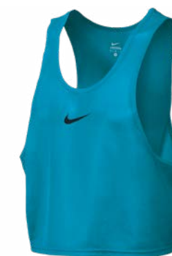
406 Photo Blue