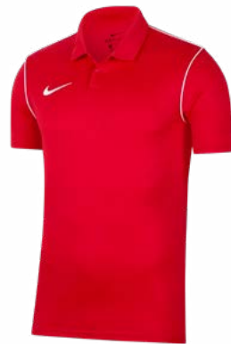
657 Uni Red/White