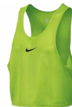
313 Action Green