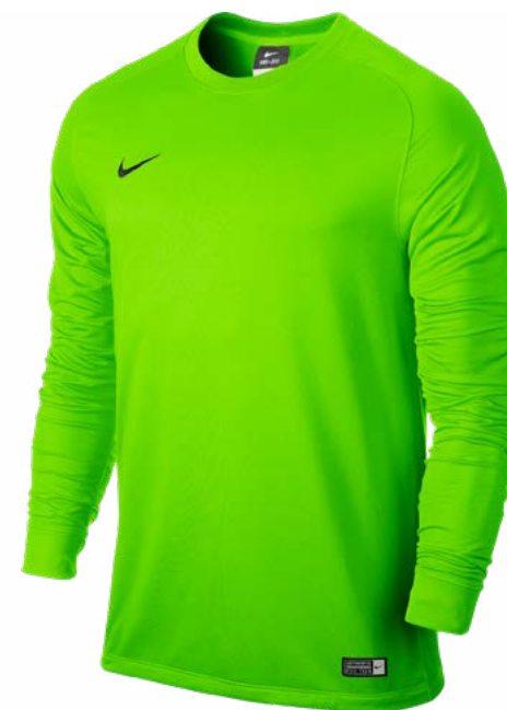
303 Electric Green