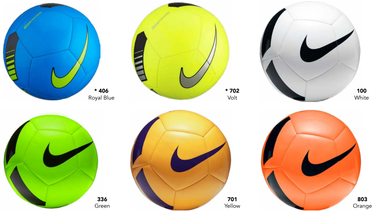
* 406 Royal Blue