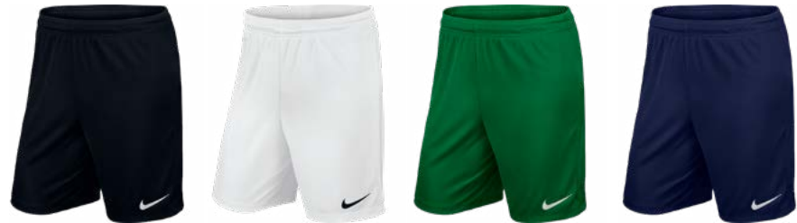
010 - Black