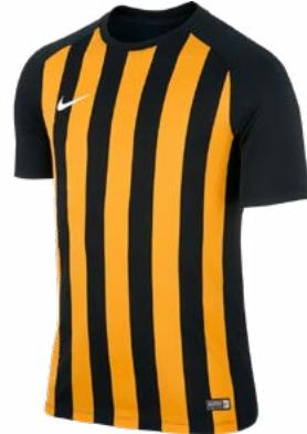
010 Black/Uni Gold