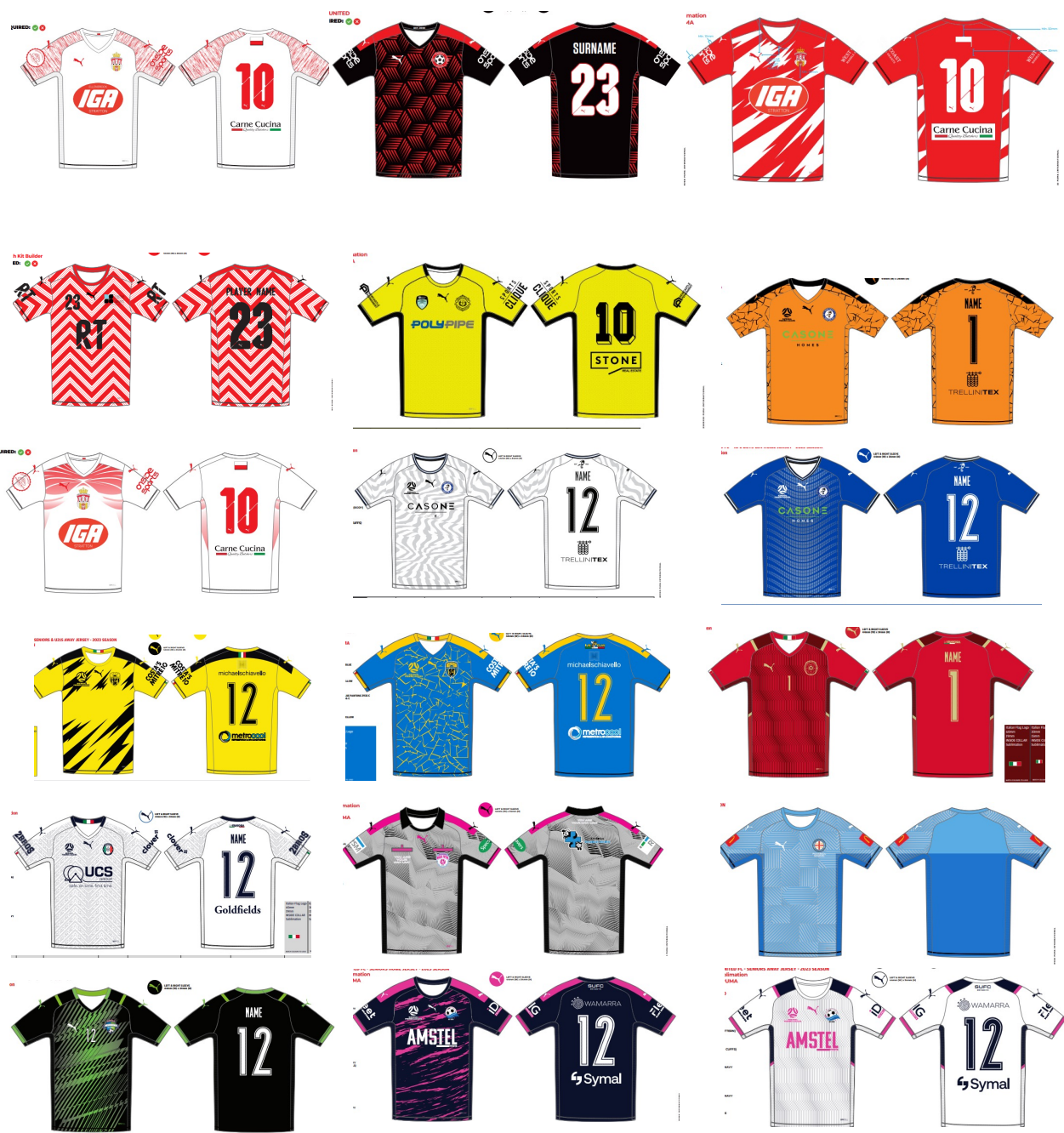
PAGE 19 GRAPHICS