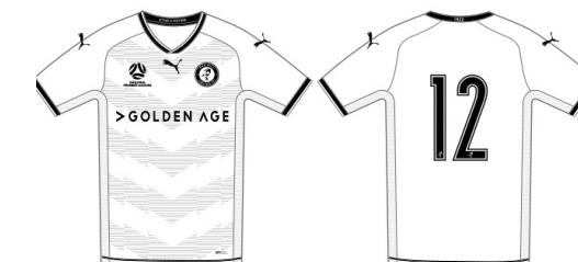
STRIPES and HOOPS